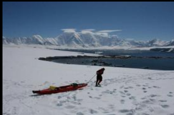
On land the team will sledge-haul their kayaks. Image of Cristian's 2008-09 expedition (click to enlarge)