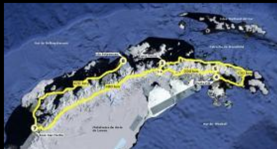
Marked destinations: Portal Point (2,) Foster Plateau (3), Victory Glacier (4), Pitt Point (4), Detroit Plateau (5), Foster Plateau (6), Argentine station San Martin (7) and Peterman Island (8). (click to enlarge)

In November, Cristian and Mario will cross the Drake Passage on board the ship 'Antarctic Dream' to get to the Antarctic Peninsula from where they will start their expedition.