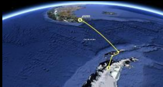
The route: Departure from Ushuaia (1) across the Drake Passage to Portal Point (2) (click to enlarge)